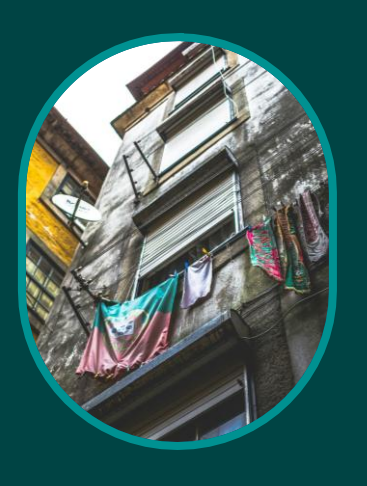
Fossil Fuel Dependence