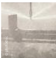
Left: Crop spraying. Right: Corn.

Overall, some of the energy saved from reducing the number of field operations is immediately lost by using more power per operation. Alternative approaches to crop production based on agro-ecological principles use nitrogen fixing plants, composts and manures together with crop rotation. This builds soil fertility, including by increasing the organic matter/carbon in the soil and increasing its moisture-holding capacity. These improvements in soil structure help reduce soil erosion and increase penetration of rainfall. Biodiversity also increases over time, which improves nutrient cycling and increases numbers of pest predators.