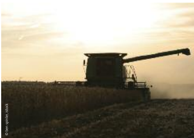
Harvesting of soy