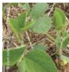
Close up of a Soya plant that has just been sprayed in Paraguay.