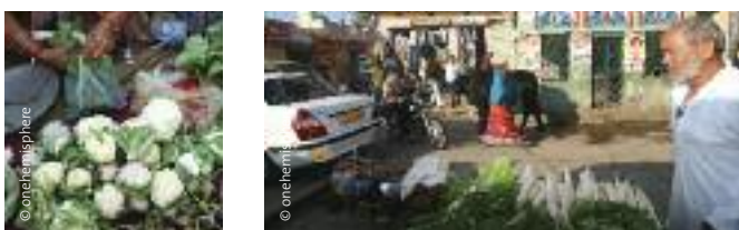
Left & Right: Market stands in Mandawa and Fatephur, Rajasthan, India.