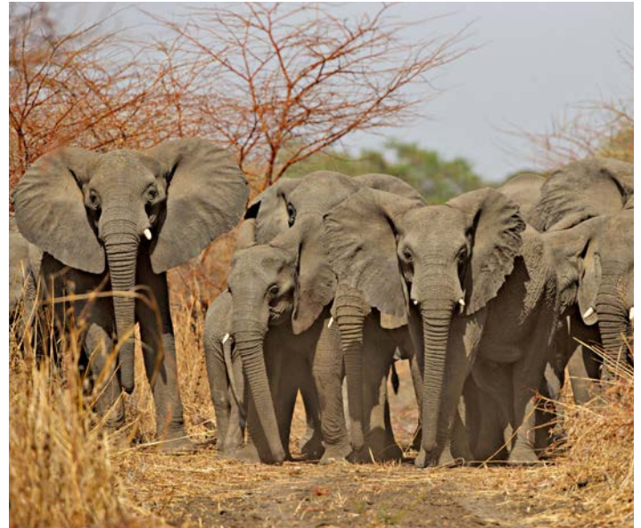
A herd of elephants at Zakouma National Park in Chad. The EU is helping protect not just the wildlife but also the people and communities that depend on the park. Read the story on europa.eu/eyd2015

Climate change is one of the greatest challenges of our time and its adverse impacts undermine the ability of all countries to achieve sustainable development. Humans are increasingly influencing the climate due to greenhouse gas emissions from burning fossil fuels, cutting down forests and farming livestock. Many developing countries are among the most affected, as these countries depend more on the natural environment while they have the least resources to cope with a changing climate.