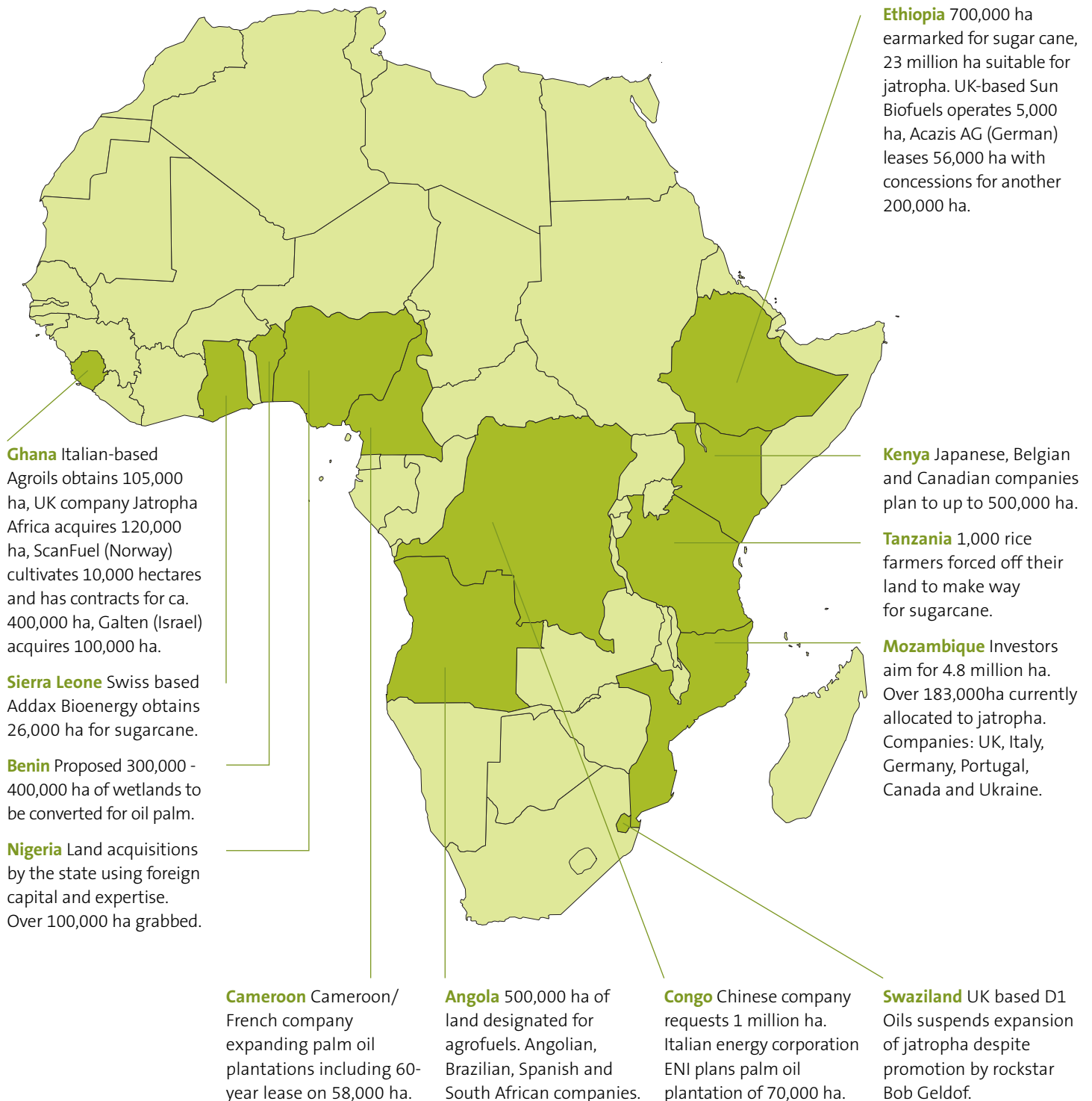
Figure 1. Reported cases of land grabbing and agrofuel developments across Africa