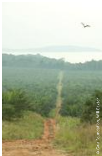
BIDCO palm oil plantation in Kalangala Islands, Lake Victoria, Uganda.

These issues need to be assessed objectively. We should not accept these arguments without subjecting them to empirical analysis. The rationale behind this research is anchored on this premise. It looks at the spread of agrofuel production across Africa and highlights the social, economic, health and environmental concerns found.