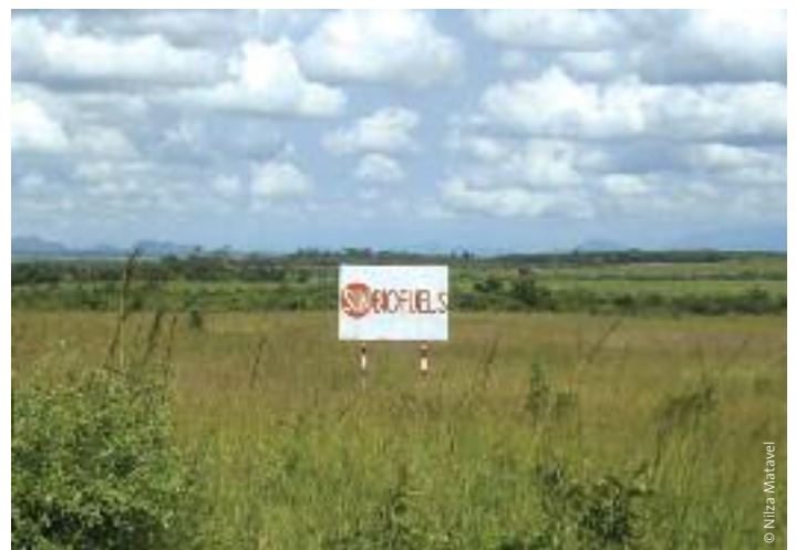
Examples of Jatropha projects in Mozambique. SunBiofuels – Manica.