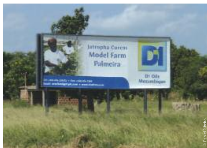
Example of Jatropha project in Mozambique. D1 Oils – Maputo.

D1 Oils’ joint venture with oil giant BP also came to an end when BP pulled out in 2009 121 .