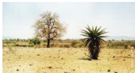
Desertification: former eastern low level crop land, Swaziland.

In Nigeria, plans for large sugar-cane plantations in Gombe State have raised concerns over pesticide use and the impact on surrounding farmland 99 .