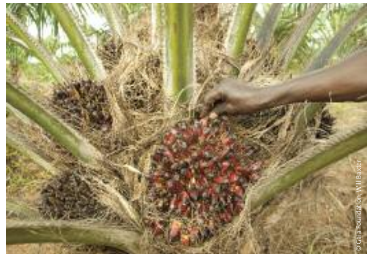
Palm oil fruit.