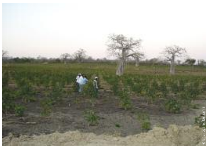
Bioshape jatropha farm in Kilwa, Tanzania.

Even more key is the availability of fertile land with available water supplies. Although there are claims that agrofuel crops such as jatropha and sweet sorghum grow well on marginal land, many of the “land grabs” for agrofuel crops involve land previously used for agriculture.