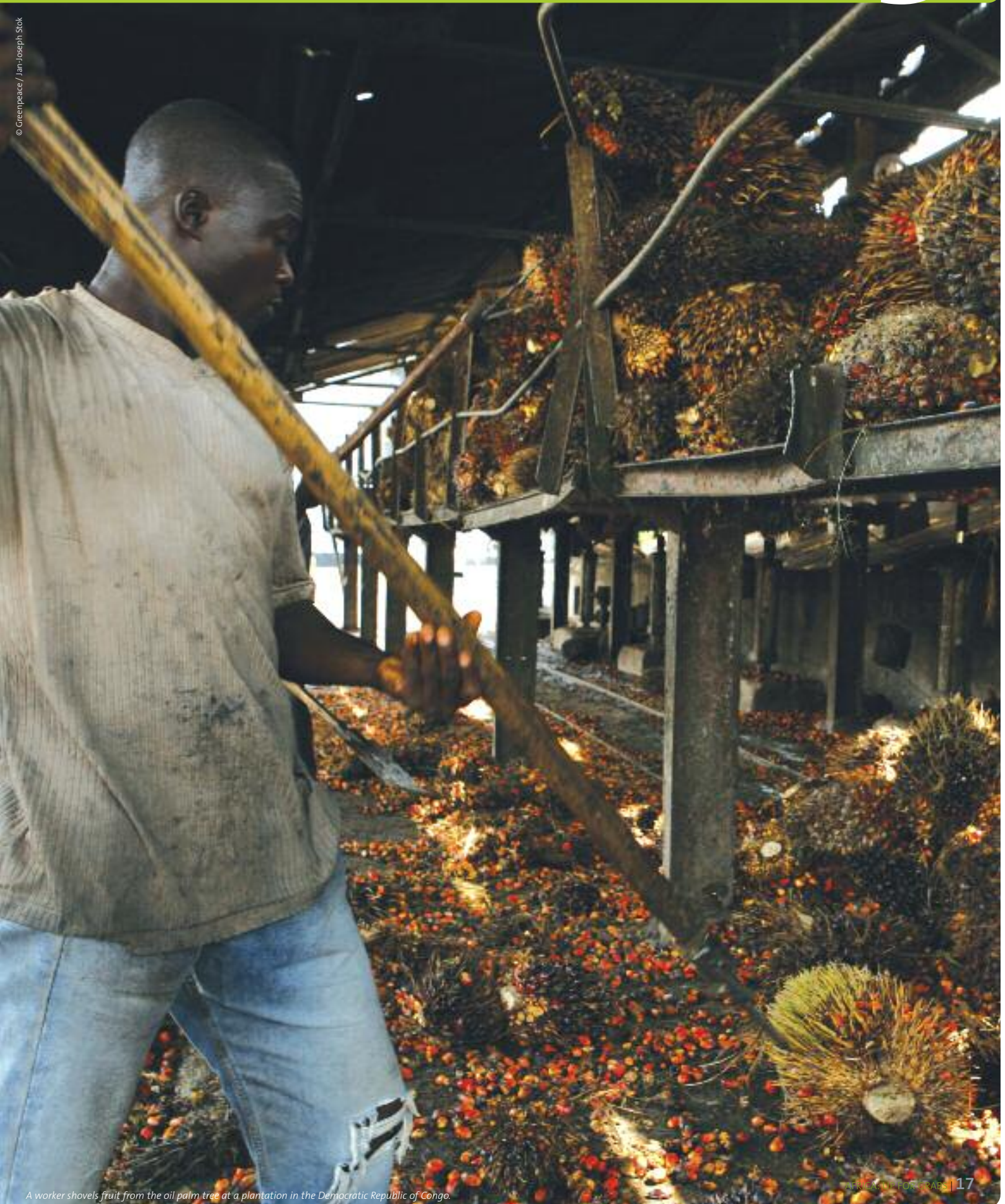
A worker shovels fruit from the oil palm tree at a plantation in the Democratic Republic of Congo.