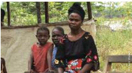
Congolese villagers living near M'Boundi.

In Tanzania, thousands of rice and maize farmers were forced off their land in 2009 or have been threatened with eviction to make way for sugarcane plantations in several parts of the country. More than 1,000 rice farmers had to leave their land on the Usangu plains in 2009, leading to widespread disputes. A similar number faced eviction from the Wami Basin to make way for a planned plantation 58 . European companies, backed by the EU Energy Initiative and UK and US aid money are behind a number of the developments 59 . Jatropha and sunflower plantations have also been proposed. Protests from the farmers have led the Tanzanian government to rethink its approach to agrofuels 60 .