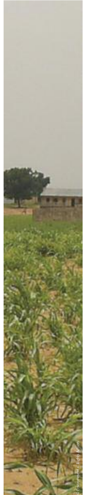
Spare-Kupto traditional farm land-Gombe, Nigeria.

Protection of farm workers: Agricultural waged workers should be provided with adequate protection and their fundamental human and labour rights should be stipulated in legislation and enforced in practice, consistent with the applicable ILO instruments. Increasing protection would contribute to enhancing their ability and that of their families to procure access to sufficient and adequate food.