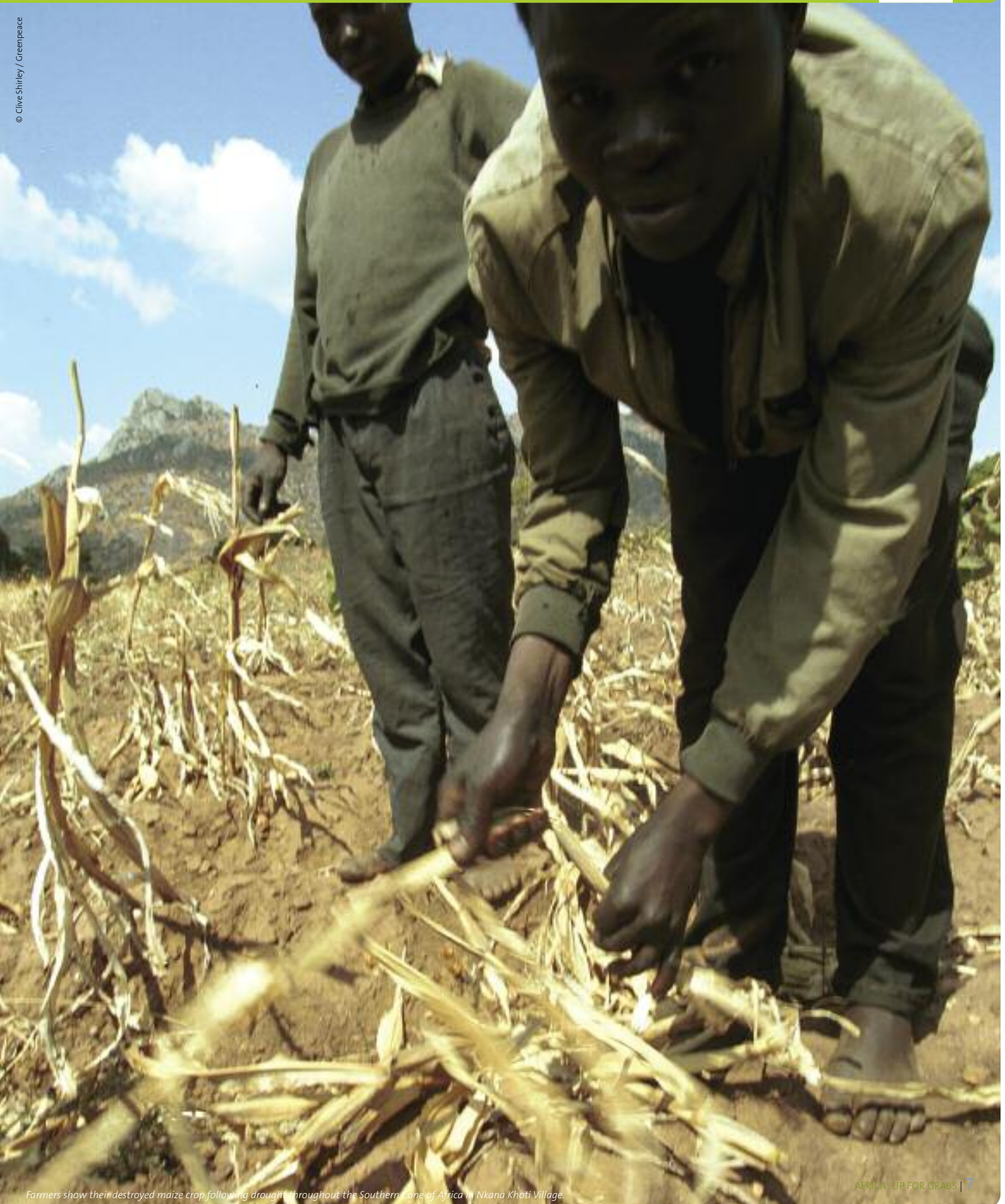
Farmers show their destroyed maize crop following drought throughout the Southern Cone of Africa in Nkana Khoti Village.