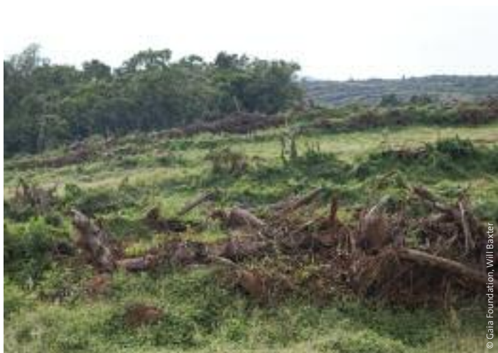
Land cleared for palm oil plantations in Kalangala Islands, Lake Victoria, Uganda.

A comprehensive list of examples of land grabs for agrofuels is found in the appendix.